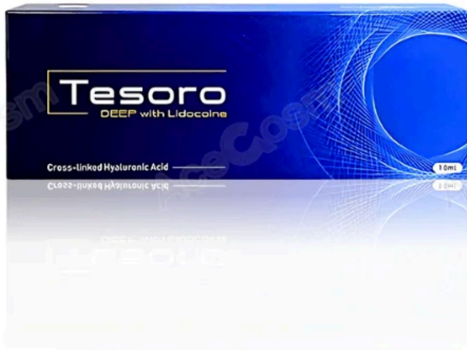
Tesoro Filler w/ Lido